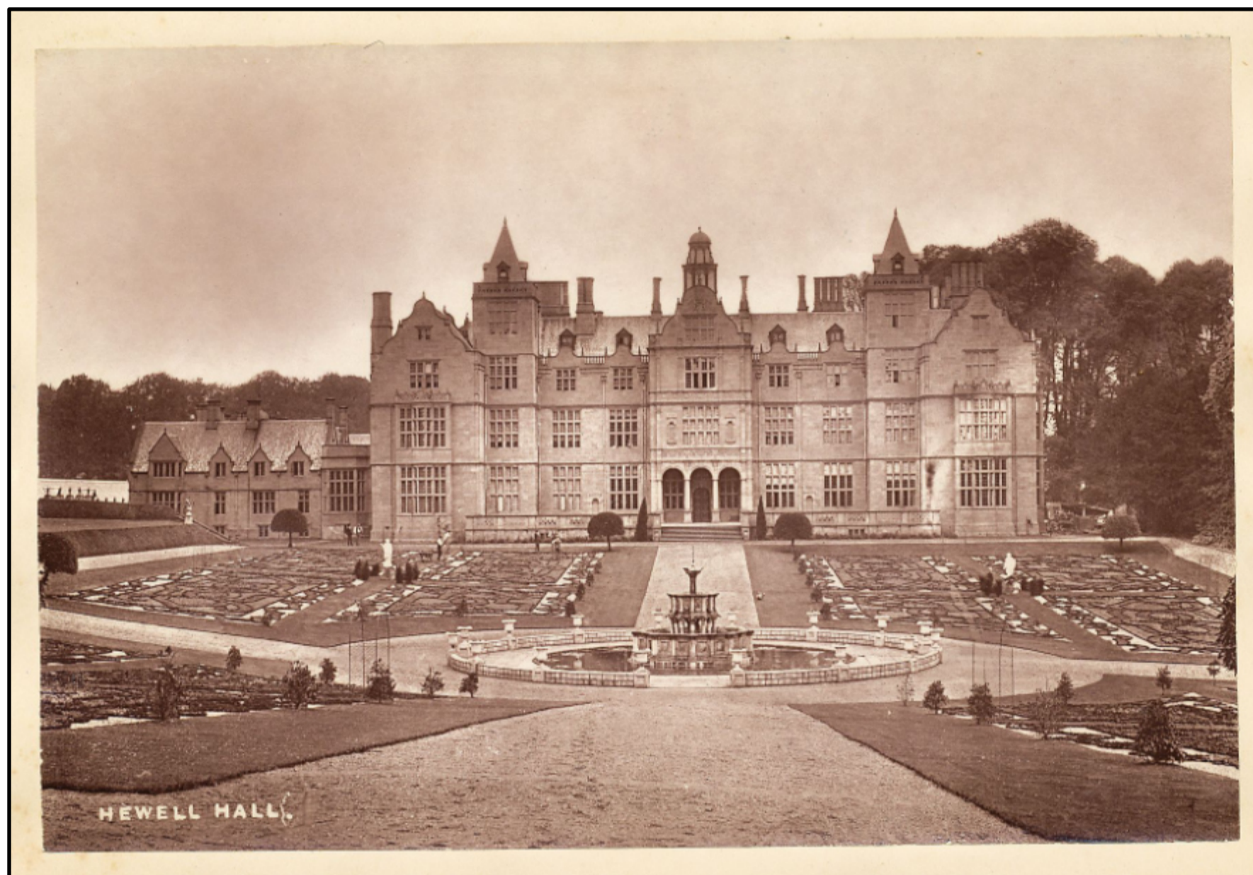
Hewell Grange in the 1920s