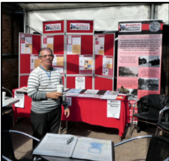
The Redditch Local History Museum stand at the National Heritage event at Forge Mill Needle Museum.