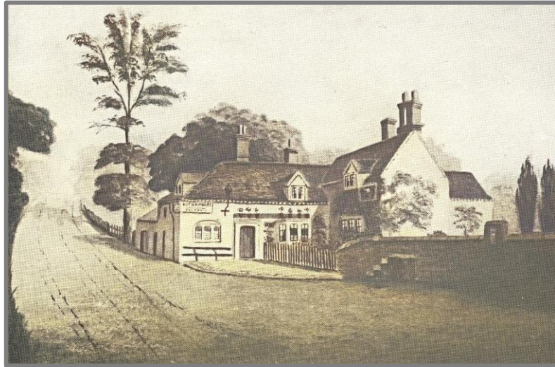
Fox and Goose, Foxlydiate

Here are three drawings by Woodward produced in the 19 th Century. This was before the late 19 th / early 20 th Century 'modernisation' of Redditch and its environs. The first (below left) is the Fox and Goose pub at Foxlydiate, the road to Bromsgrove was suddenly narrowed due to the shape of the building, and so this had to be demolished in the early 20 th Century. The middle picture is the Kings Arms at the top of Holloway Lane, which was very narrow at this time. The right-hand side of the pub was similarly demolished to widen the road, and it was later rebuilt to the Kings Arms we see today. The right-hand picture is a drawing of the Toll House for the Birmingham to Pershore Turnpike road as it left Redditch south. The Redditch north tollhouse was 'Granny Lockes' at Bordesley Corner.