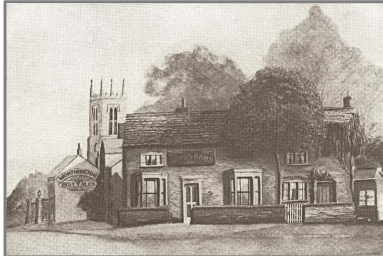
Kings Arms, Beoley Road