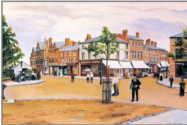
Town Centre Crossroads